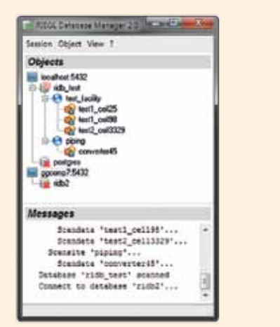
Fig. 1 RIEGL Database Manager